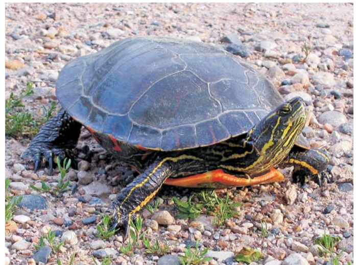
State reptile, Painted turtle ( Chrysemys picta )