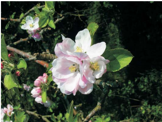
State flower, Apple blossom ( Malus domestica )