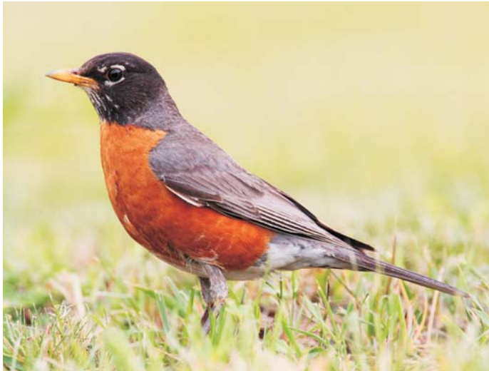
State bird, American robin ( Turdus migratorius )