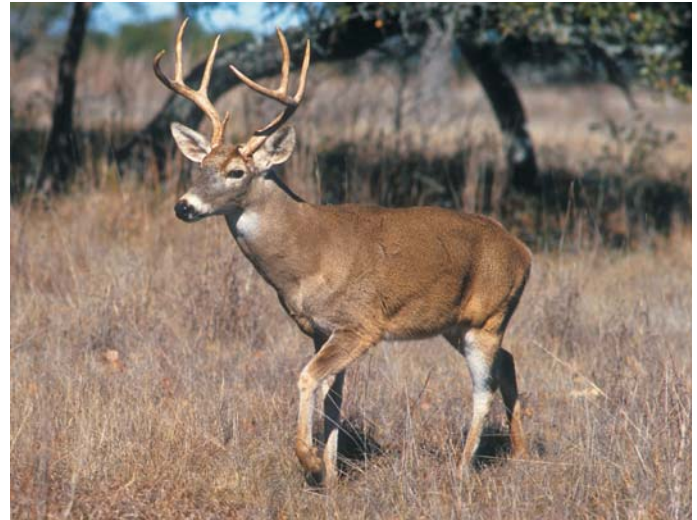
State game mammal, White-tailed deer ( Odocoileus virginianus )