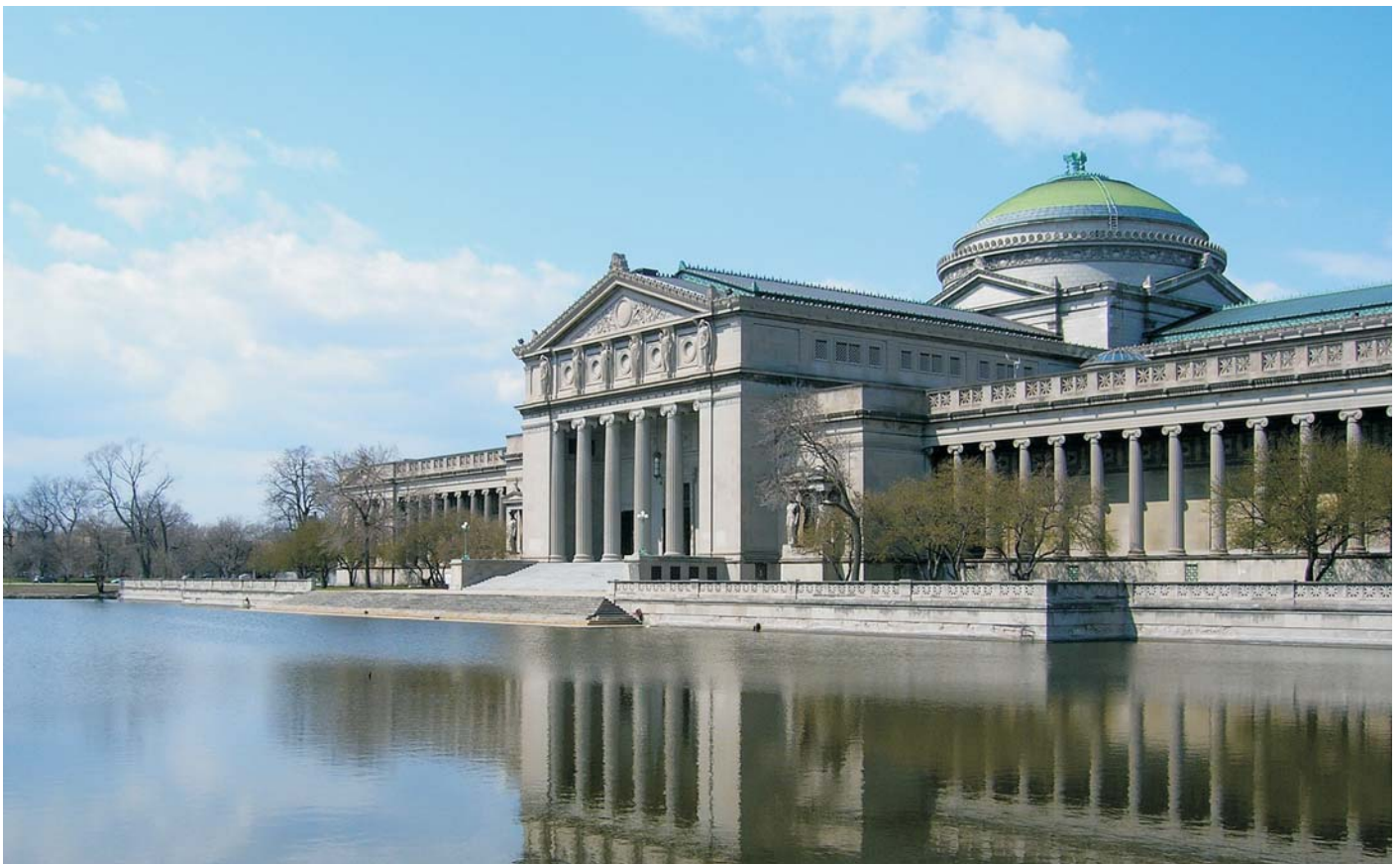
Chicago, top, is the largest city in Illinois and the third largest in the United States. It sits along the shores of Lake Michigan, which is the only one of the five Great Lakes of North America that is located entirely in the United States. The city is home to the Museum of Science and Industry, bottom, located between Lake Michigan and the University of Chicago. Housed in the former Palace of Fine Arts from the 1893 World's Columbian Exposition, its exhibits include a full-size replica coal mine, a German submarine captured during WWII, and Apollo 8's command module.